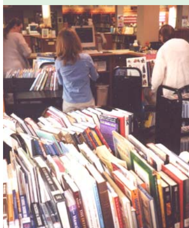
The circulation staff check in returned materials.

Circulation increased from 28,191 in the fiscal year 1997-98 to 530,050 items loaned in 2007-08. The increase is attributed to the amount of growth in our area during this time period. Our population exploded from about 10,000 when the current library opened in 1998, to about 50,000 today.