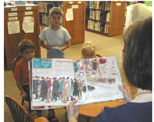
Story time at the library can host only six children due to space constraints and fire code regulations.