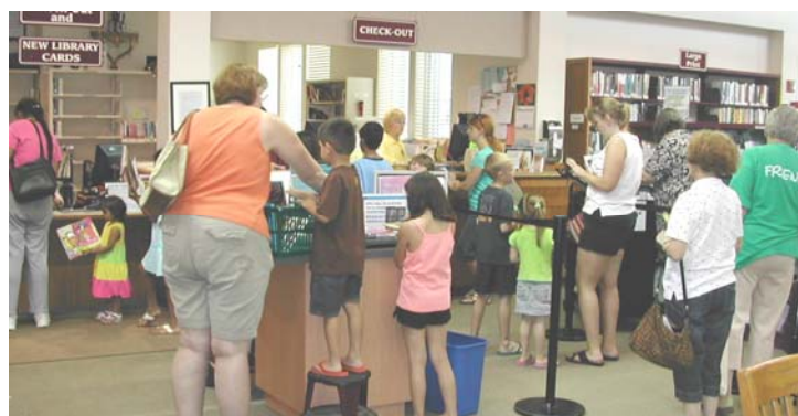
People wait at the busy check-out desk

Circulation increased from 28,191 in the fiscal year 1997-98 to 530,050 items loaned in 2007-08. The increase is attributed to the amount of growth in our area during this time period. Our population exploded from about 10,000 when the current library opened in 1998, to about 50,000 today.