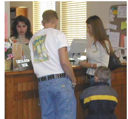
A family checks out their materials at the circulation desk.