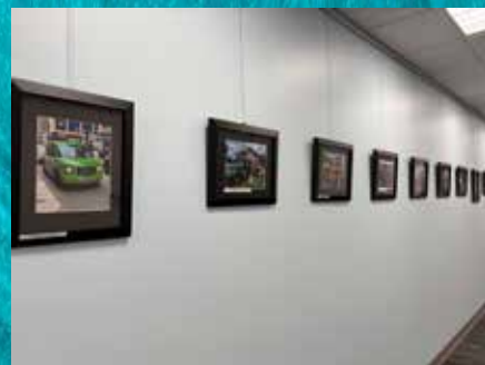
Sun City Photographers, March 2025

The Art on Display Gallery features artwork by local artists. The exhibits are on display for one month.