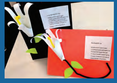
Handprint Lily Begins Sunday, May 1 while supplies last. Location: Children's Desk Children will enjoy making and giving this Mothers' Day gift!