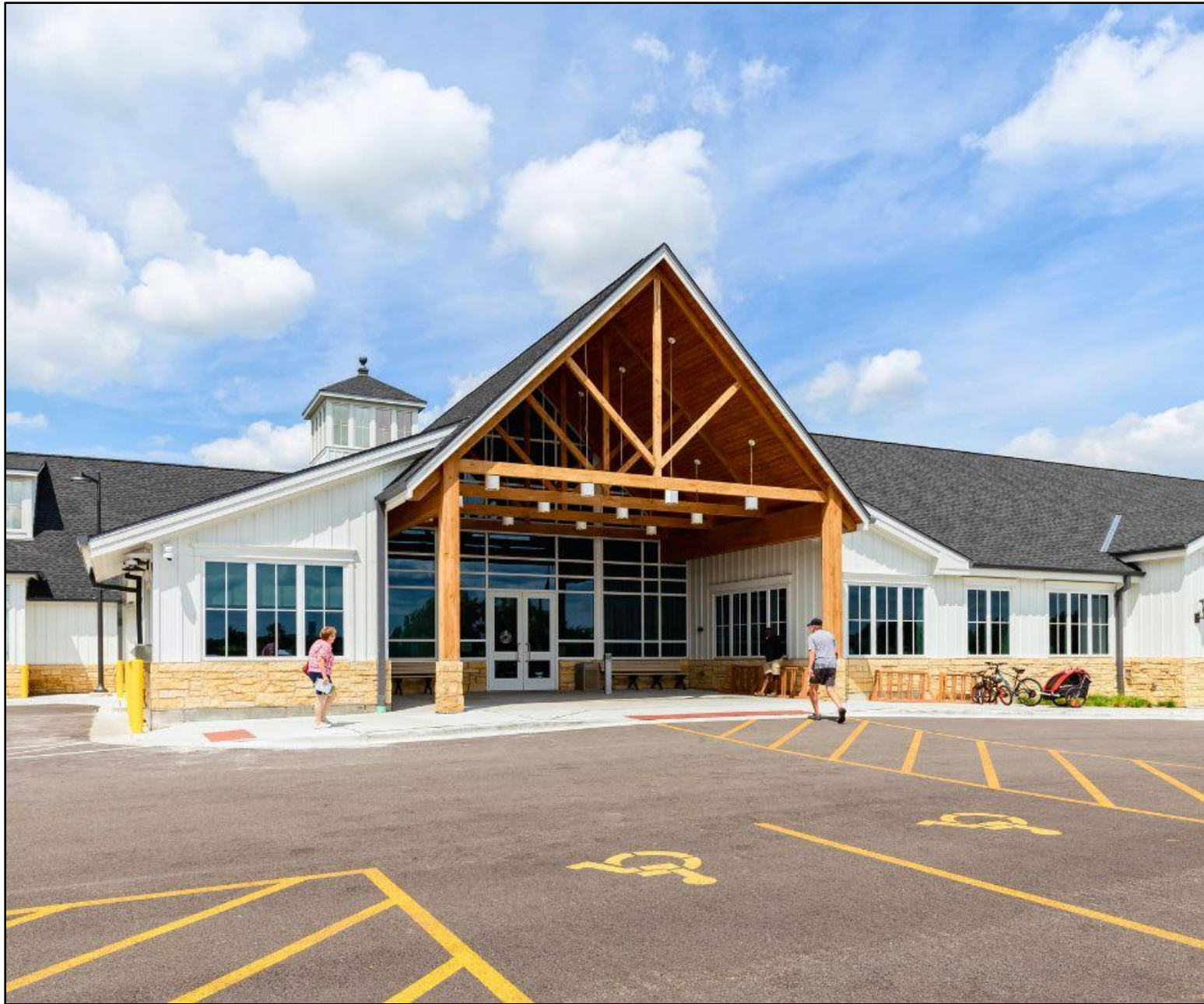
This is our library, the Huntley Area Public Library.